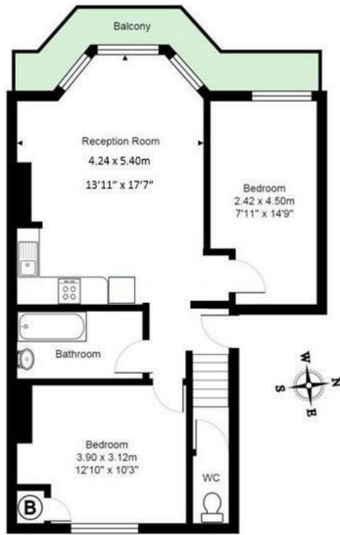
Total Area: 57.2 m 2 ... 616 ft 2 (excluding balcony) All measurements are approximate and for display purposes only.